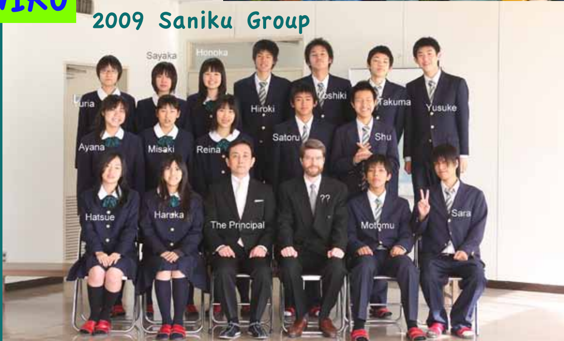
2009 Saniku Group