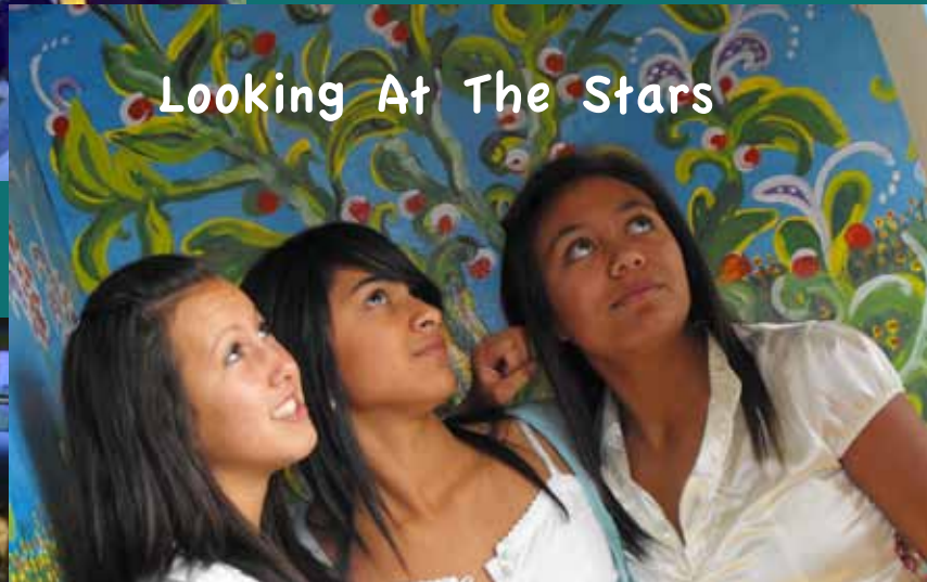
Looking At The Stars