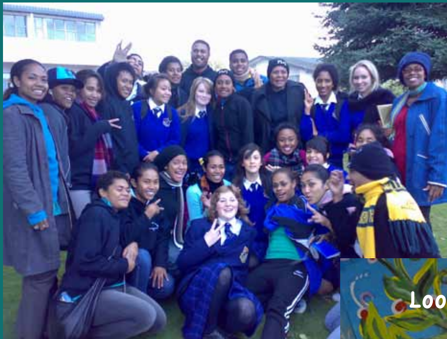
Visit by students from Suva Adventist High School who visited early this year