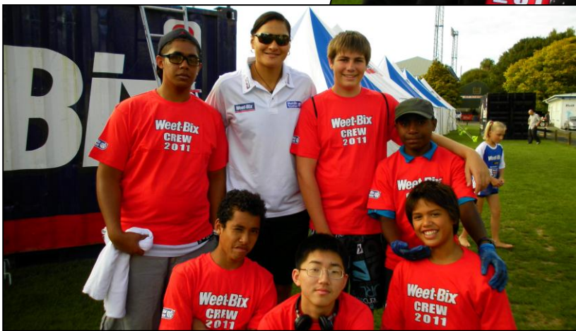
← Olympic gold medalist, Valerie Vili, with some of the boarders.

PO Box 14001, Longburn 4866, New Zealand