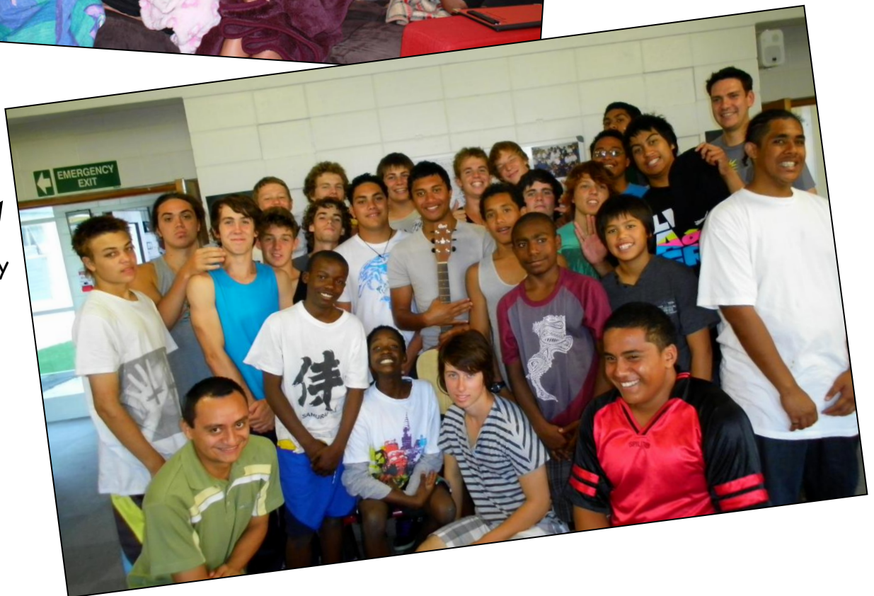
Boys dormitory boarders ☺