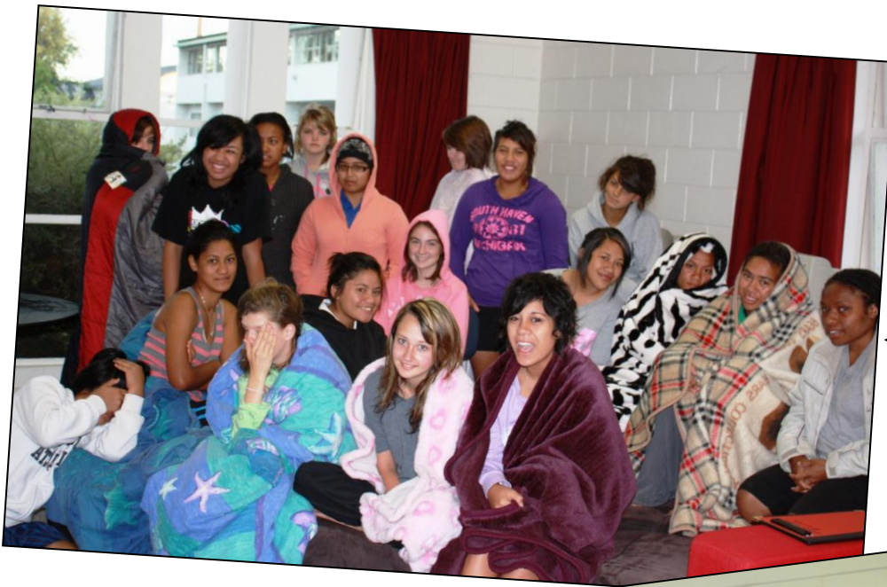
Girls dormitory boarders ☺