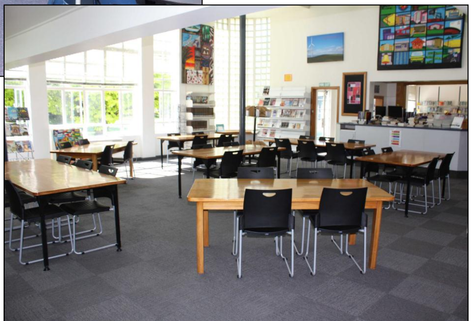
The Library with new carpet and new chairs