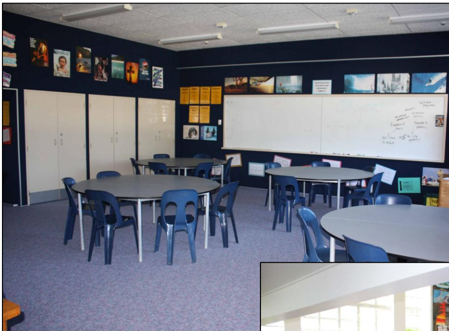
One of the smart looking Intermediate rooms

Special thanks to the proprietors, NZ SDA Schools, for funding this major project and helping make the college a more inviting place for our student's. The Attendance Dues parents pay are being put to good use in improving the teaching spaces at the college.