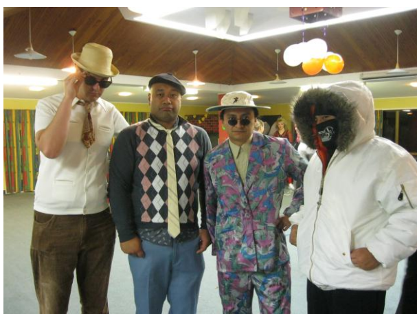
Time enjoying each others company...