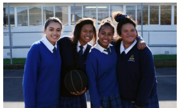
Photos from skipping club, Staff vs Girls soccer and around campus during lunch break.