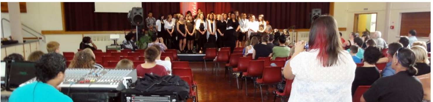
The boarders taking the service at Mosaic Church back in March