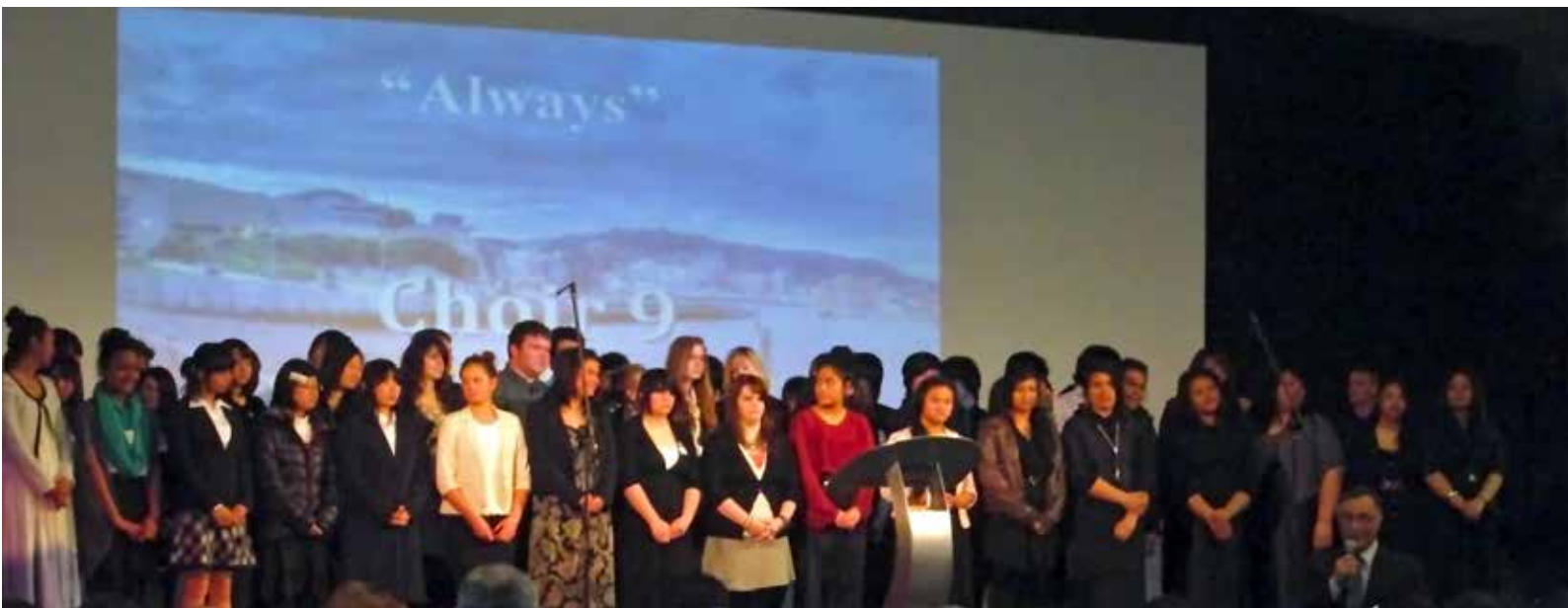
The dorm choir perform the final item for the Wellington Regional Church service