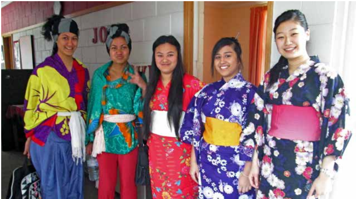
Mufti day efforts of the girls' dorm