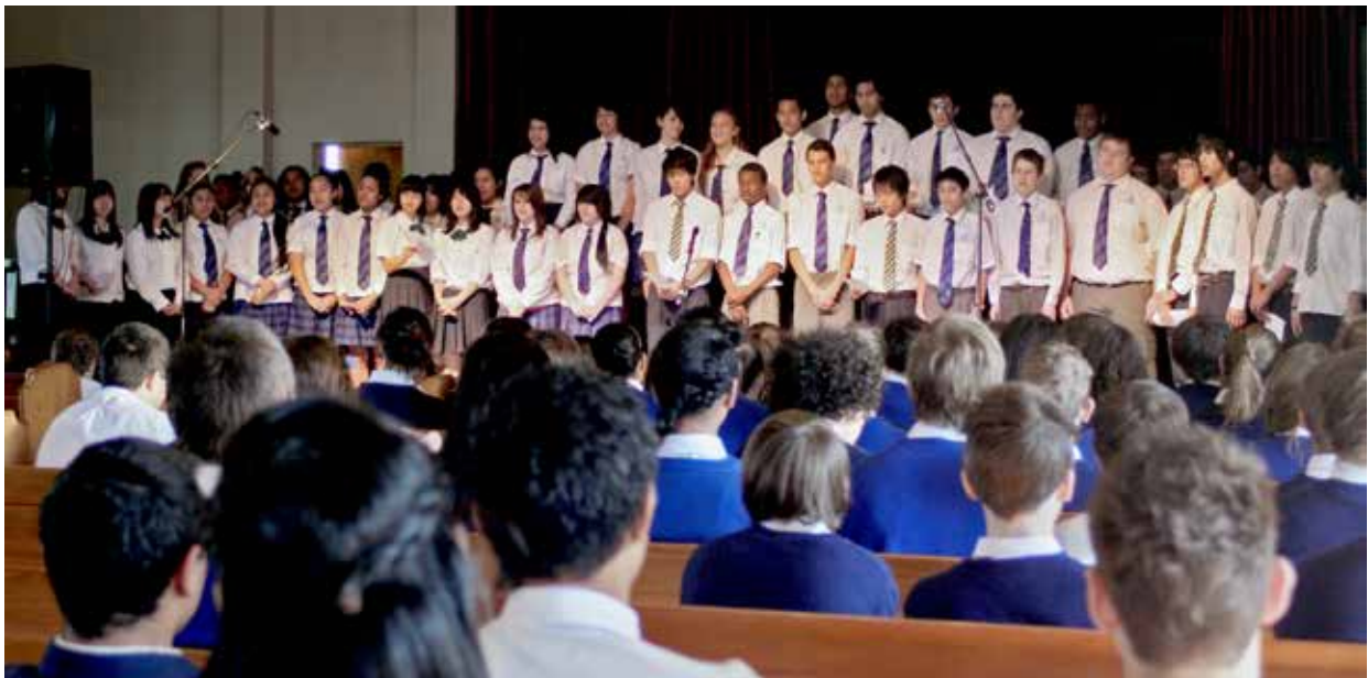
The whole dorm sang for school chapel