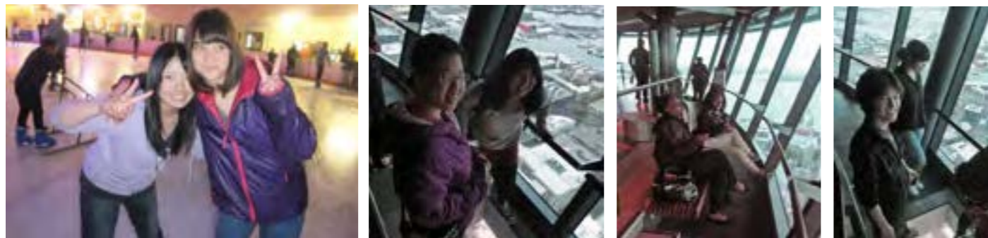
Ice Skating, Sky Tower, Papatoe SDA Church & Auckland Museum