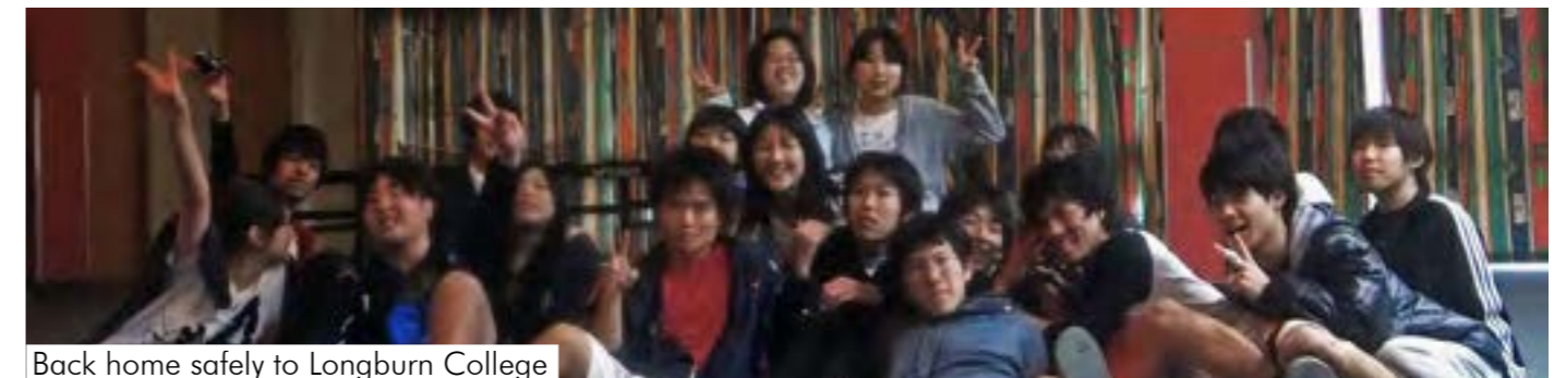
Back home safely to Longburn College