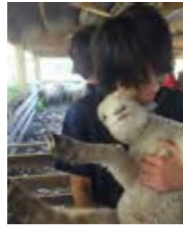
The boys slept at the shearer's shed