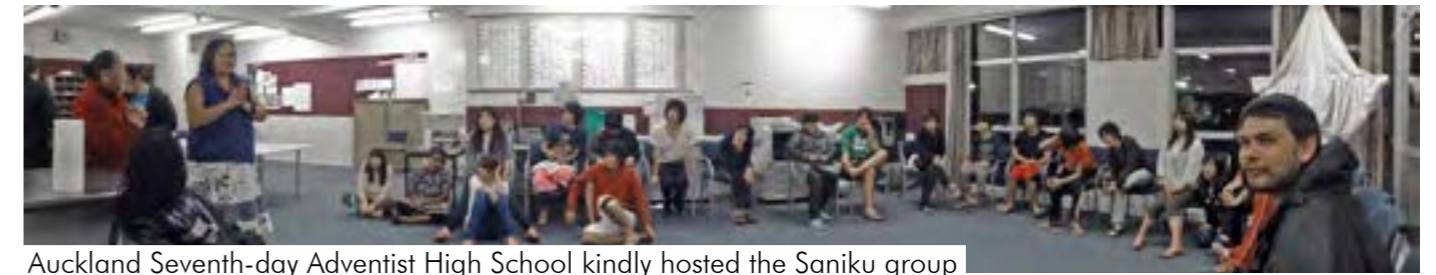
Auckland Seventh-day Adventist High School kindly hosted the Saniku group