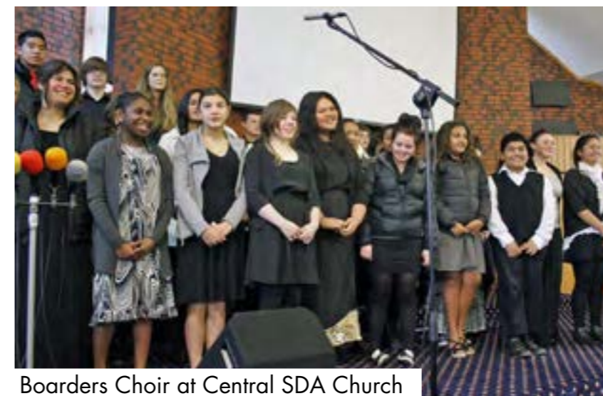
Boarders Choir at Central SDA Church