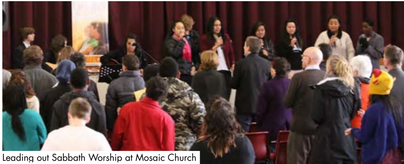
Leading out Sabbath Worship at Mosaic Church