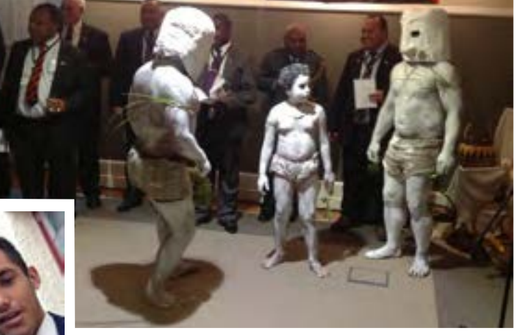
The fearsome tribal 'mud men' greet the visitors to the PNG emabassy in Wellington.