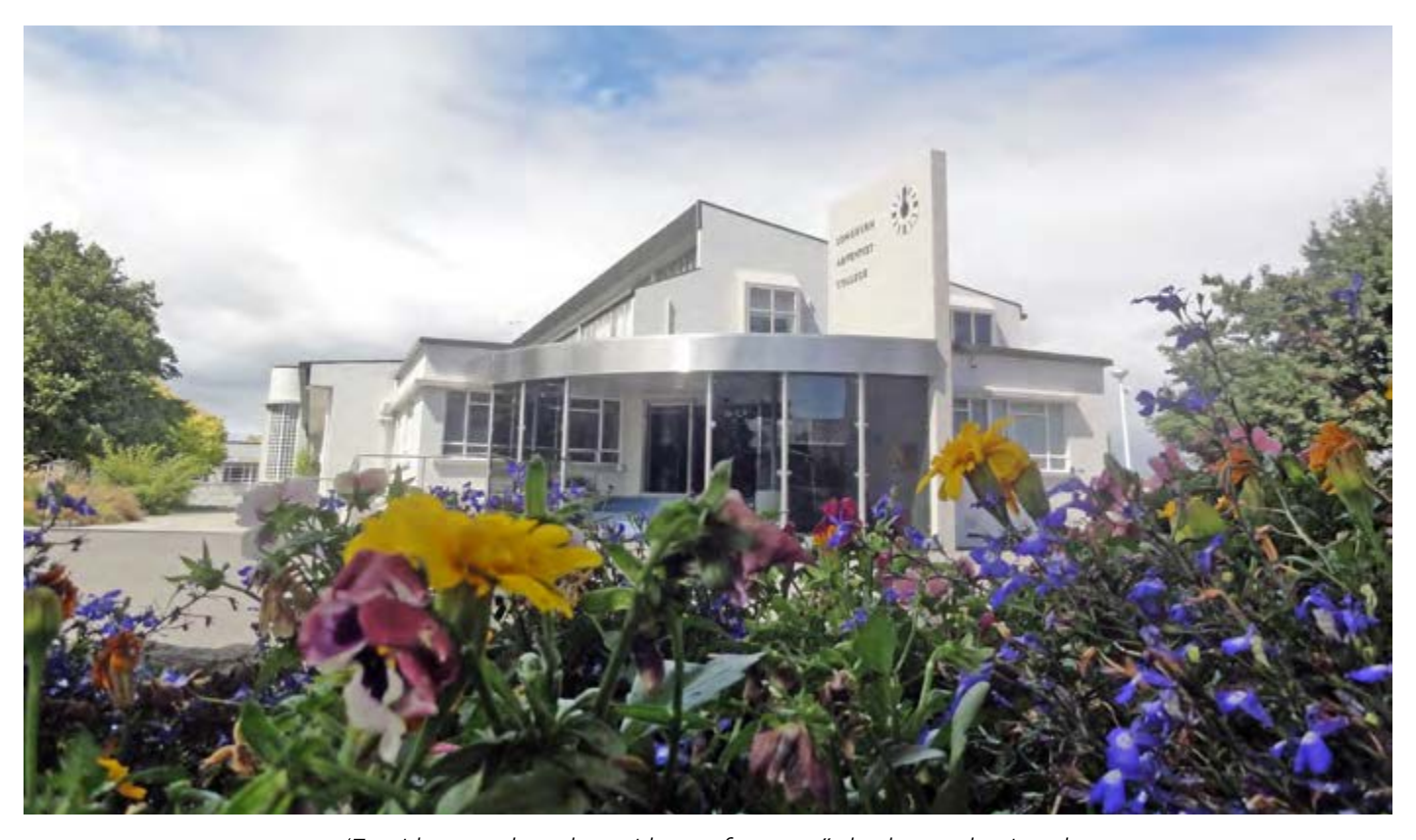
'For I know the plans I have for you," declares the Lord, "plans to prosper you and not to harm you, plans to give you hope and a future.'