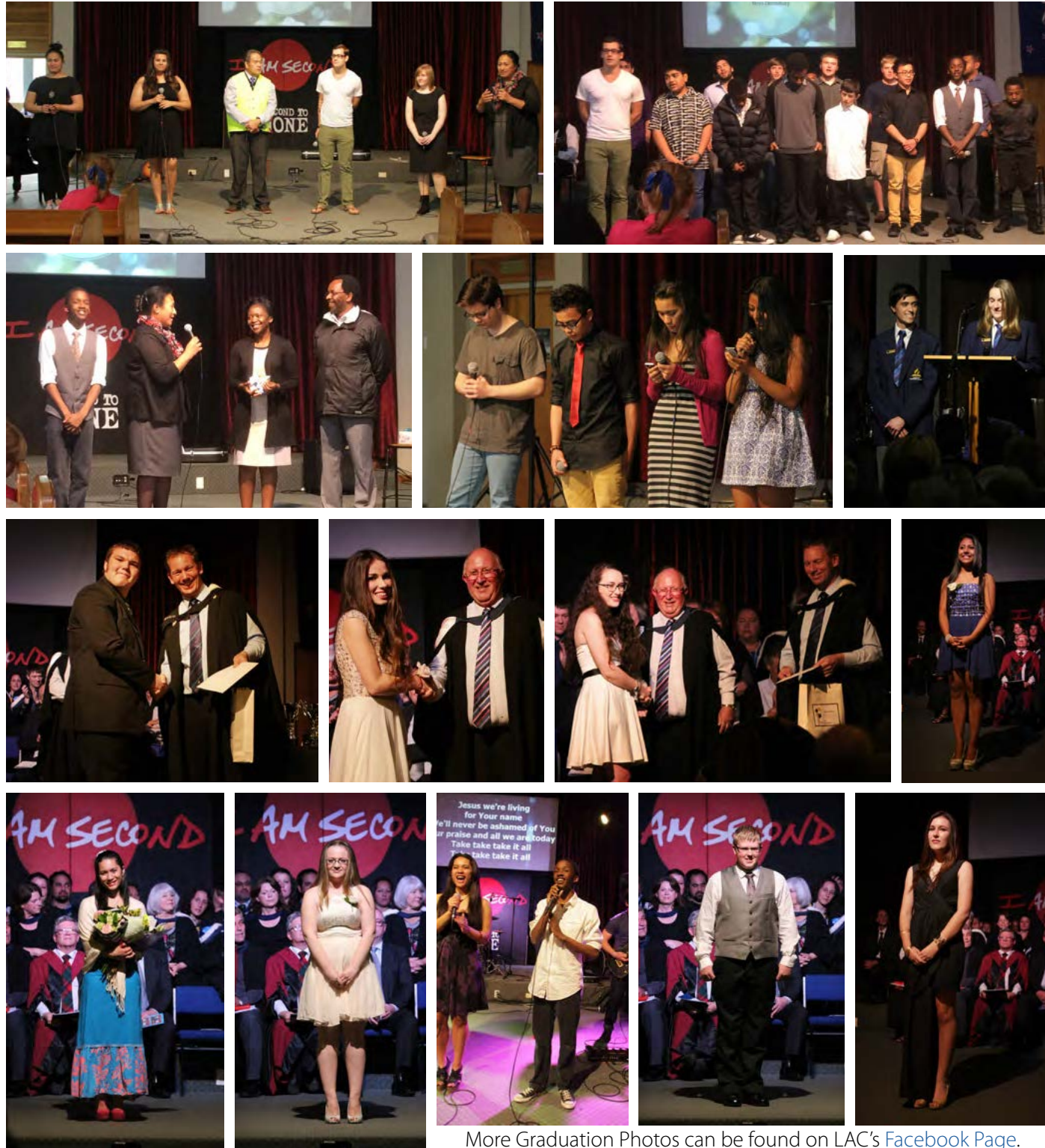
More Graduation Photos can be found on LAC's Facebook Page .